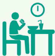
have lunch / eat lunch