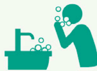
wash your face