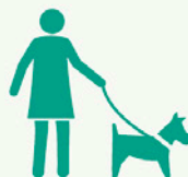
walk the dog