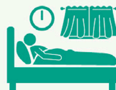
go to bed