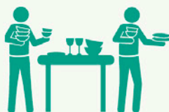
clear the table