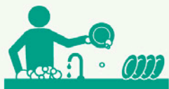
do the dishes (US) wash the dishes (UK)