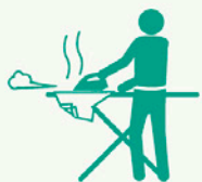
iron a shirt